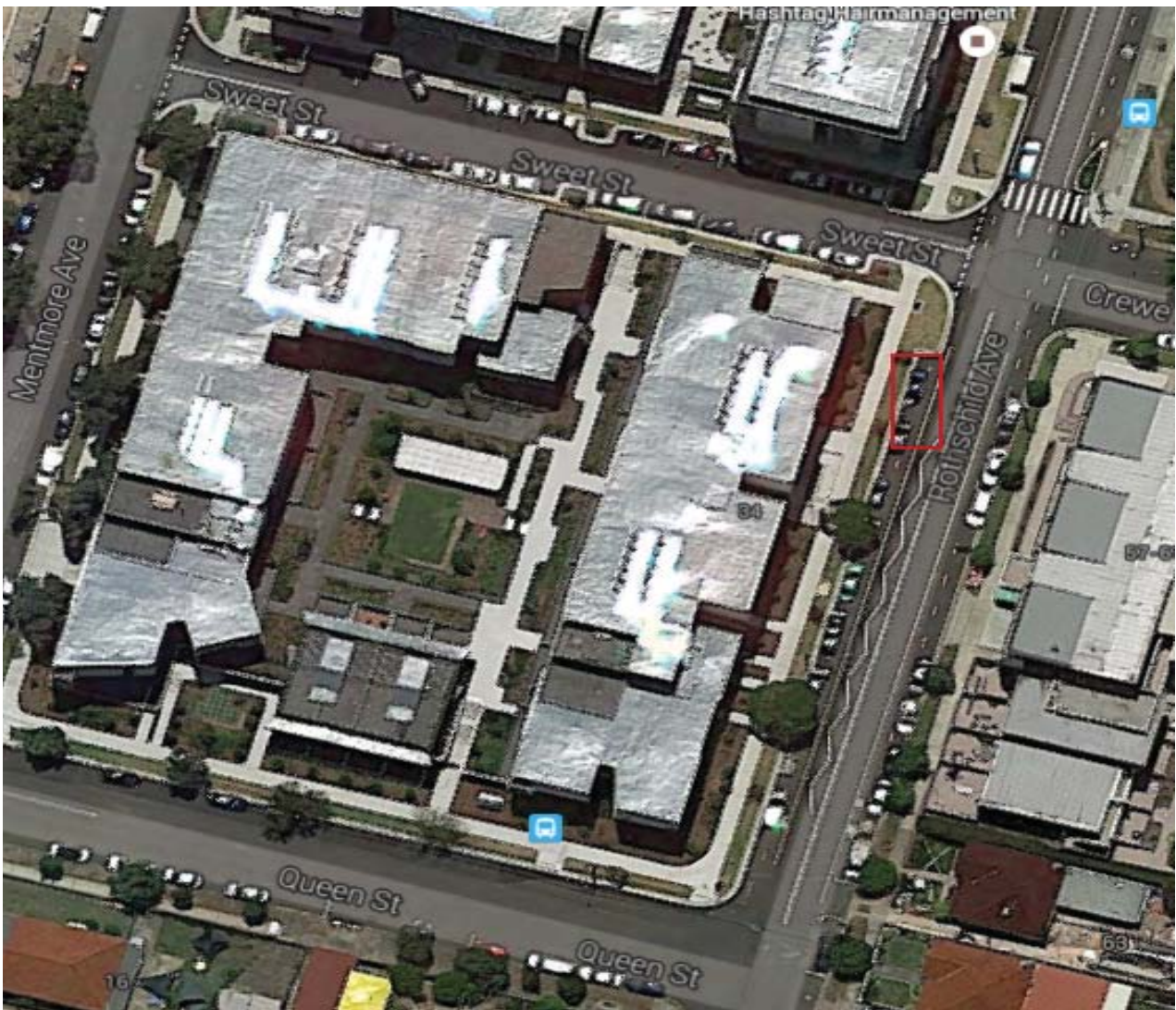
PROPOSAL ROTHSCHILD AVENUE ROSEBERY PROPOSED CAR SHARE